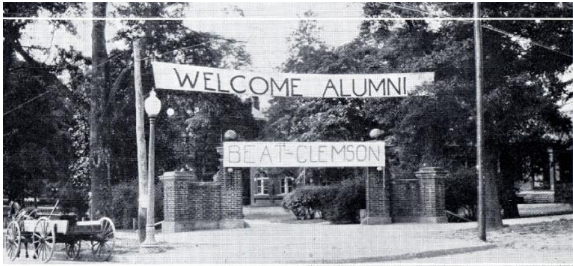
Auburn Main Gate Image from 1929 Glomerata

Note the two large trees between the gate and the streets, neither of which is a live oak.