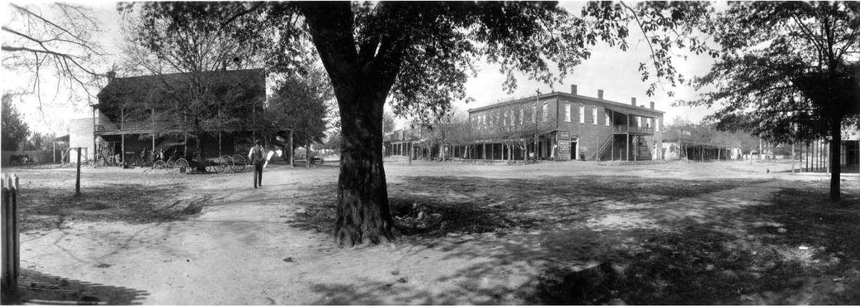
Intersection of College and Magnolia around 1899

No one knows the trees' origin for sure. Based on the old photo below, at one time their age was estimated to be 130 years.