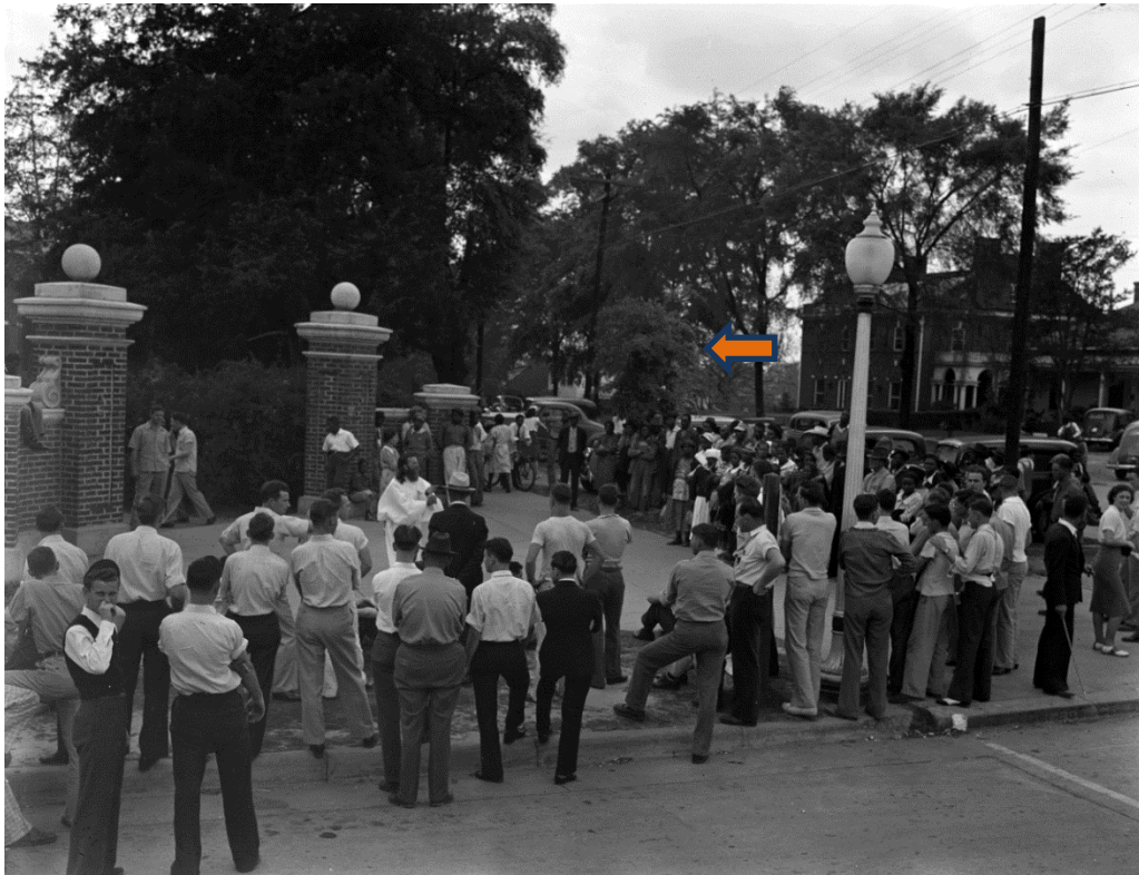
negative dated April 23, 1939

The arrows on these two photos indicate young Magnolia Avenue and College Street Oaks.