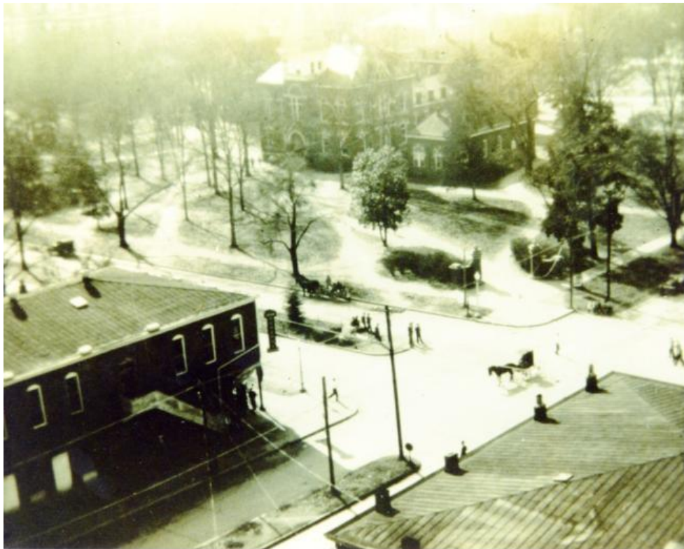
print dated January 9, 1937

Note the two large trees between the gate and the streets, neither of which is a live oak.