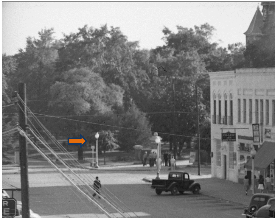
print identified as October 1942

The arrows on these two photos indicate young Magnolia Avenue and College Street Oaks.