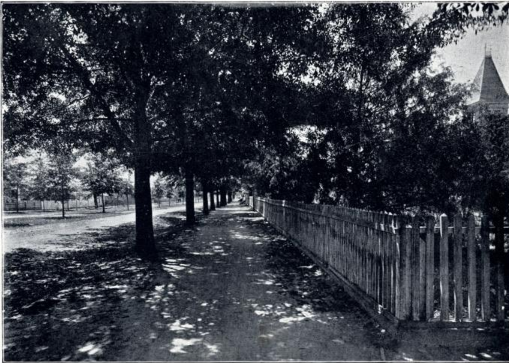
Facing south along College Street from corner at Magnolia Avenue

What a peaceful walk it must have been in 1900 along the College Street border of the Auburn campus. The Chemistry Building (Hargis Hall) is visible on the right. There was no entrance to the campus from the corner at College and Magnolia.