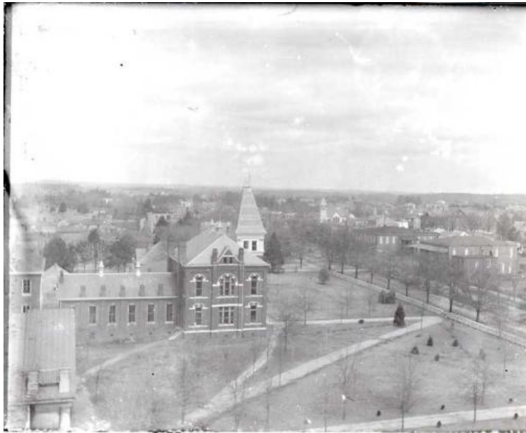
View of Toomers Corner from New Main (Samford Hall)

Study of the photographic record shows that large trees have graced the College and Magnolia boundaries of the Auburn campus for over a century. A few of these photos are shared here: